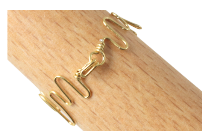
8. Insert the hook into the eye, check and size again. Here it should be a little large in size. This can always be adjusted little by little by bringing the curves/waves closer together or pulling them further apart.