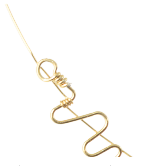
9. Så skal perlerne vikles på ringen. Åben ringen op igen. Brug 0,3 tråd, lav et par viklinger på starten af den første bue.