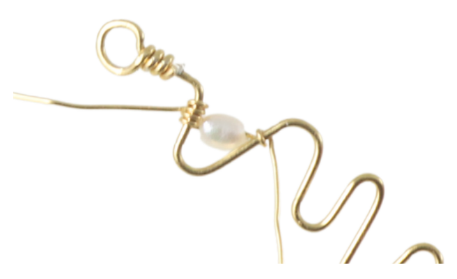
10. Then wrap the beads on the ring. Open up the ring again. Using 0.3 thread, make a few wraps at the start of the first wave.