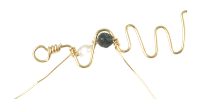
11. Keep threading beads on, followed by a few wraps. When you reach the end, cut off the remaining thread. Pass the hook through the eye again. Adjust the shape of the ring on the ring mandrel. And then you're done!