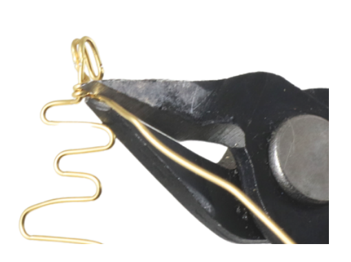
7. Then make a few wraps with the remaining thread.